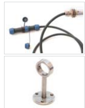
ACC.085 Inox Holder

* Available in different lengths upon request.