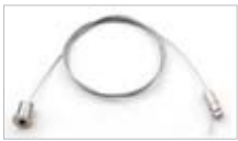
ACC.062 Suspension kit